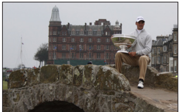
● Martin Kaymer clutches the Alfred Dunhill Links Championship trophy on the Swilcan Bridge.