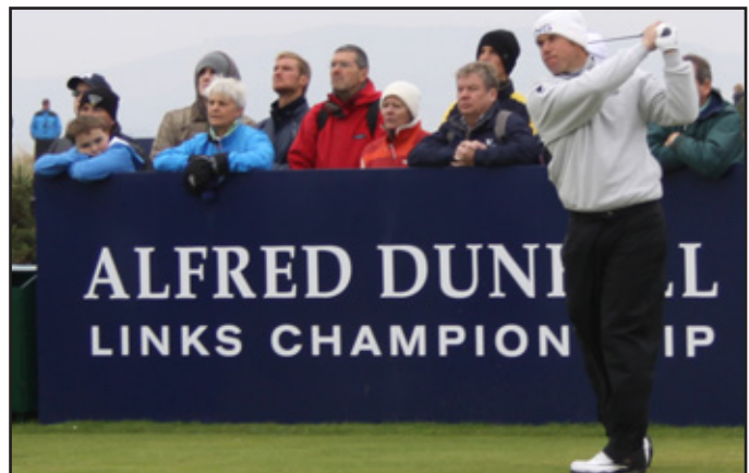
● Lee Westwood needed a top-two finish to become world number one.