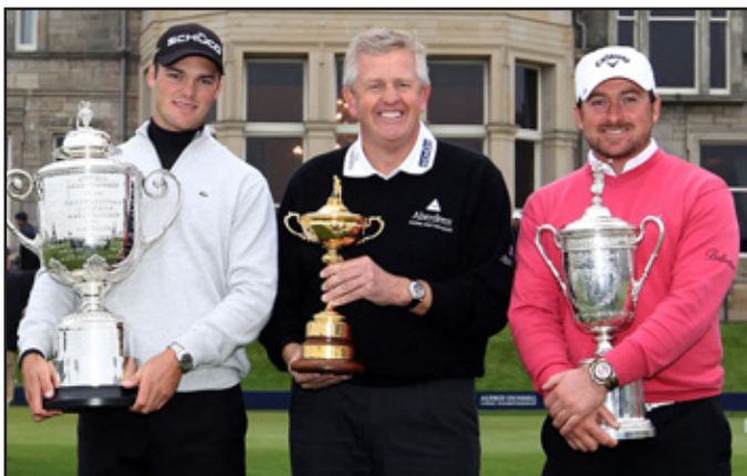
● Martin Kaymer, Colin Montgomerie and Graeme McDowell celebrated a European treble with the USPGA, Ryder Cup and US Open trophies.