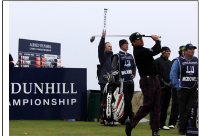
● Graeme McDowell tees off at the 12th.

There was a distinctly celebratory feel to this year's Alfred Dunhill Links Championship from a European point of view as nine of the 12 members of the victorious Ryder Cup team from the previous week took part and one of their number, Martin Kaymer, took the trophy.